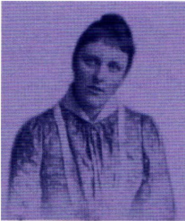
Theodate Pope while at Miss Porter's School, 1888.

...Today we spent all the time from half past ten until five in the afternoon at the exposition. It is in very rough state as yet but we managed to see the French and English pictures very well. The pictures were arranged well, as often as possible those by the same artist were hung near one another so that at a glance you could see the characteristic points of any certain painter.... Now the impressionists are interesting, but I doubt if any of the work they are now doing will last. It has its place in history because they came in just the right time. They are showing us that nature should be studied out of doors & that no landscape ought to be painted in the studio. They are bringing us a freshness that Corot, Rousseau, Daubigny, and other artists of that school never dreamed of. Never the less they are going too far in the opposite direction but still it takes some men to go beyond the line in order to bring others to it or as Papa says the impressionists are shouting in order to be heard.