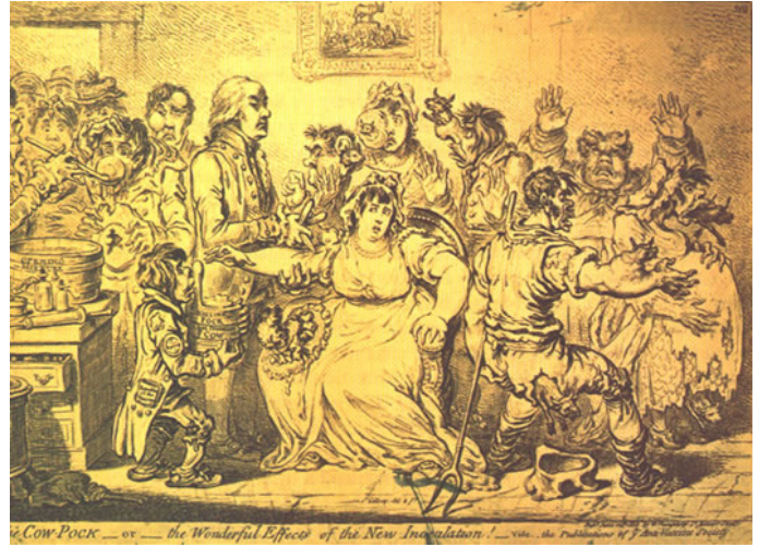
An etching from the Anti-Vaccine Society illustrating the fear of the new method of vaccination with the cowpox virus introduced in 1796.